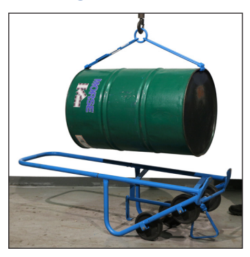
Get a drum horizontal with Morse model 160 Drum Truck. Then lift it with model 41 Drum Lifting Hook.