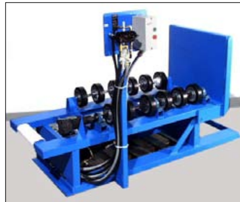
Custom Hydra-Lift Drum Roller with controls on opposite side