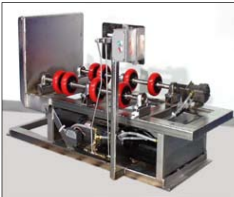
Custom Hydra-Lift Drum Roller made of type 304 stainless steel.