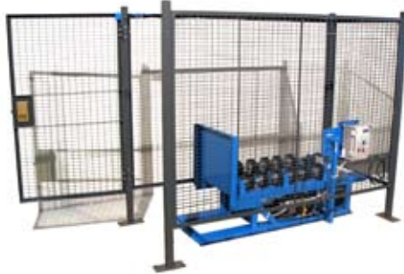
Guard Enclosure with safety interlock (Drum Rotator sold separately).

Exterior dimensions of enclosures for Hydra-Lift Drum Rollers are L88" W40" H74" (224 x 102 x 188 cm).