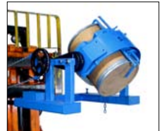
Forklift-Karrier with 55/30-16