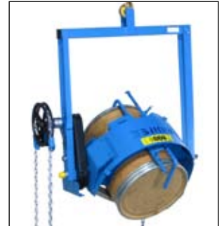
Kontrol-Karrier with Model 55/30-16

Insert the correct size Diameter Adaptor to handle your smaller drum. Diameter Adaptors are available for sizes from 14" to 22" diameter. They are available to fit below-hook Kontrol-Karriers, as shown here, Forklift-Karriers, Hydra-Lift Karriers, and Vertical-Lift Drum Pourers.